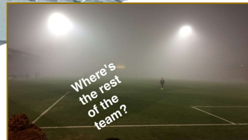
Yeovil v Portsmouth 30Dec16 Match played for full 90 minutes